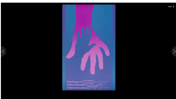
Show images from eBooks as a slideshow.